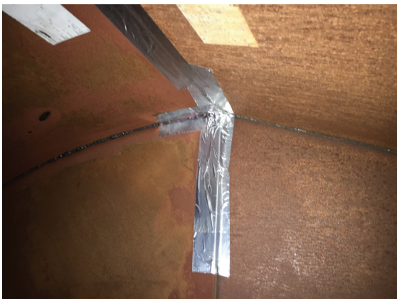
Grease duct seams inappropriately covered with duct tape (typically used for residential clothes dryer exhaust duct), presumably applied to pass a leak test.

Unfortunately, there are no safeguards or regulations in place to keep any of this from occurring. And when problems do occur, the inevitable finger pointing ensues.